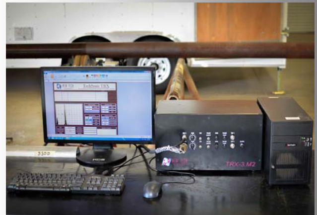
TRX Platform Electronics: TRX Scope, Computer, and Software

The TRX Platform UT Scopes™ is New Tech Systems groundbreaking UT scope developed in-house specifically for the OCTG inspection industry. For many years the OCTG inspection industry has been utilizing UT scopes that were developed for use by many different industries (aerospace, pipeline, refineries, etc.), and as such, the UT scopes had many settings and were very complicated to setup and operate. The TRX platform UT scopes can be easily configured by entering a few values such as nominal wall and setting the gates. Setup can be performed in minutes as many of the complicated settings and calculations are performed automatically by the software. The TRX platform scopes are capable of I.D. and O.D. flaw differentiation, and inspection results are displayed in an easy to read chart. In addition, the TRX scope can display the analog events like traditional UT scopes or display events only indicating when a flaw is detected. An optional dual scanner setup is available to allow simultaneous scanning of the pin and box. The TRX scope is a game changer in the industry due to its simple setup, calibration, and ease of use.