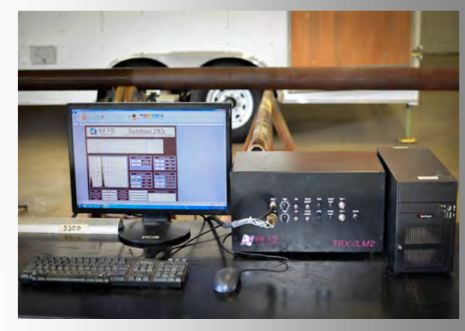
TRX Platform Electronics: TRX Scope, Computer, Monitor, and Soft-

The TRX Platform UT Scopes™ is New Tech Systems ground breaking UT scope developed in-house specifically for the OCTG inspection industry. For many years the OCTG inspection industry has been utilizing UT scopes that were developed for use by many different industries (aerospace, pipeline, refineries, etc.), and as such the UT scopes had many settings and were very complicated to setup and operate. The TRX platform UT scopes can be easily configured by entering in a few values such as nominal wall and setting the gates. Setup can be performed in minutes as many of the complicated settings and calculations are performed automatically by the software. The TRX platform scopes are capable of I.D. and O.D. flaw differentiation and inspection results are displayed on an easy to read chart. In addition, the TRX scope can display the analog events like traditional UT scopes or display events only indicating when a flaw is detected. An optional duel scanner setup is available to allow simultaneous scanning of the pin and box. The TRX scope is a game changer in the industry due to its simple setup, calibration, and ease of use.